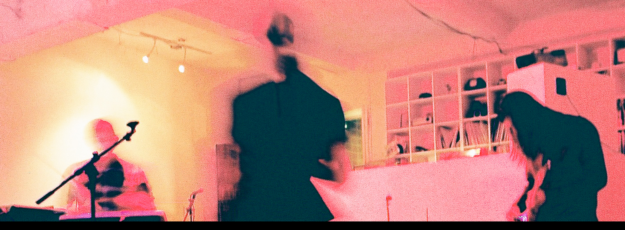
CLONES OF THE QUEEN